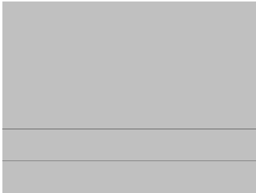
Figure 2: Forecast of %Female Faculty, assuming different proportions of female hiring.

For the sake of a simple model, let us assume that all professors over the age of 65 will retire in the next five years, and all professors between 60 and 65 retire in the subsequent five years, and further, that new hires replace these retirees. Then, as shown in Figure 2, if 20% of the new hires are women (i.e. about the level of the current hiring pool), about 21% of the professors will be women in the year 2015. Even if we replace all of the retiring professors with women, only about 38% of the faculty will be women in 2015. It seems that a reasonable target would be to try and hire between 30% and 40% women, for a target of 23-25% of the faculty being women in 2015. In order to achieve this goal we must continue our proactive search for high-quality women, work on retention of women we have, and further improve on the hiring pool.